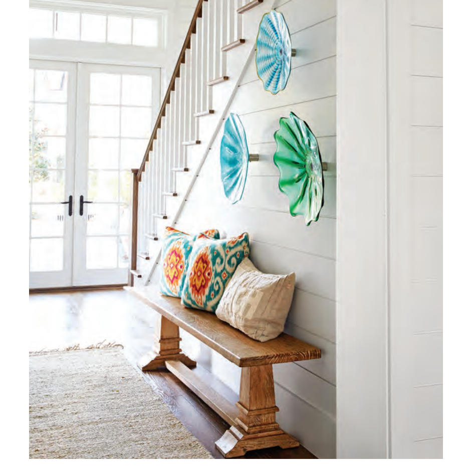
OPPOSITE: A school of silver-leaf fish hovers above the crisp kitchen and highlights the stainless-steel appliances and shimmery backsplash. ABOVE: Art glass platters create a dimensional focal point while filling a triangular space in the entry hall. BELOW: Deep porches and balconies, big windows, squared columns, and generous overhangs highlight the consistent Southern coastal look of homes in WaterColor.